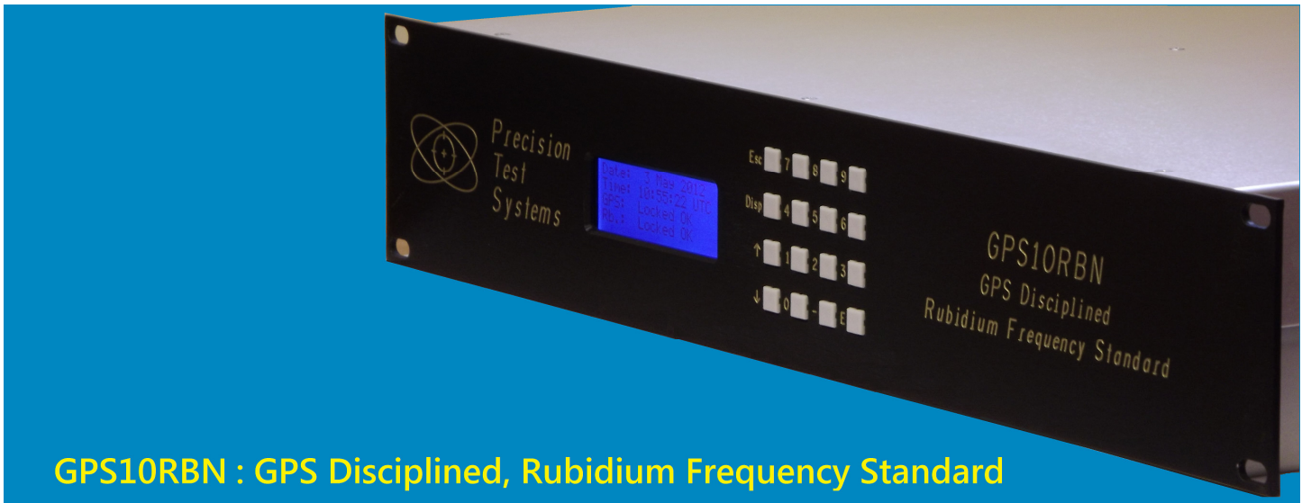
GPS10RBN : GPS Disciplined, Rubidium Frequency Standard