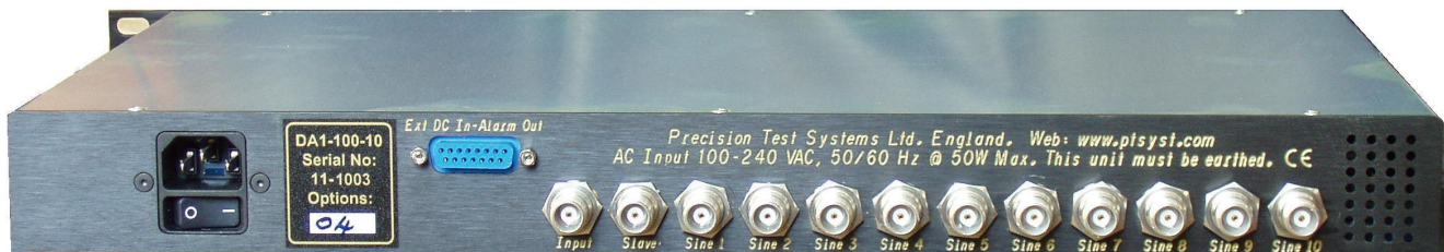
DA1-100-10 Rear view (with option 04 TNC Connectors).

Precision Test Systems also manufactures the PTS50 and DA1010 series of distribution amplifiers. These models are lower cost alternatives to the DA1-100-10 but still give very good performance.