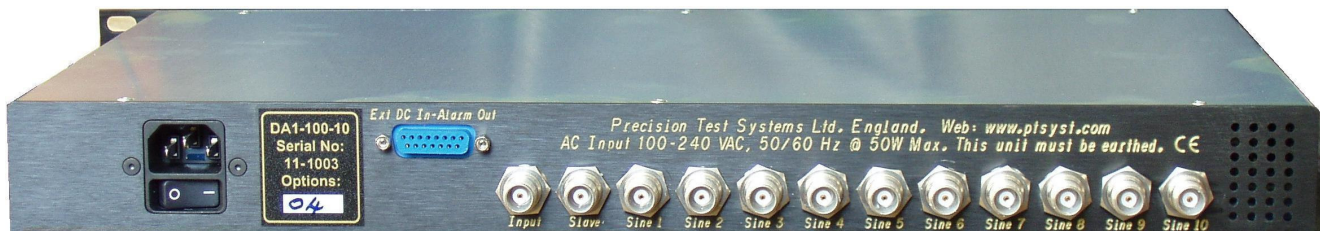
DA1-100-10-5MHz Rear view (with option 04 TNC Connectors).

Precision Test Systems also manufacturers the PTS50 and DA1010 series of distribution amplifiers. These models are lower cost alternatives to the DA1-100-10-5MHz but still give very good performance.