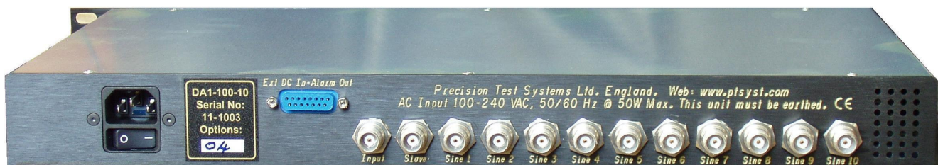
DA1-100-10-13MHz Rear view (with option 04 TNC Connectors).

Precision Test Systems also manufacturers the PTS50 and DA1010 series of distribution amplifiers. These models are lower cost alternatives to the DA1-100-10-13MHz but still give very good performance.